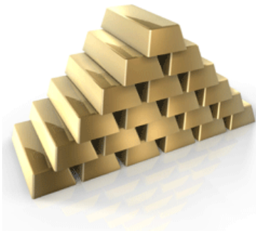
A pile of gold bars valued at £2.7m